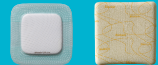
Biatain® Silicone Biatain® Non-Adhesive