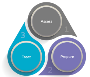
The Coloplast 3 Step Approach