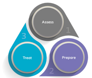
The Coloplast 3 Step Approach