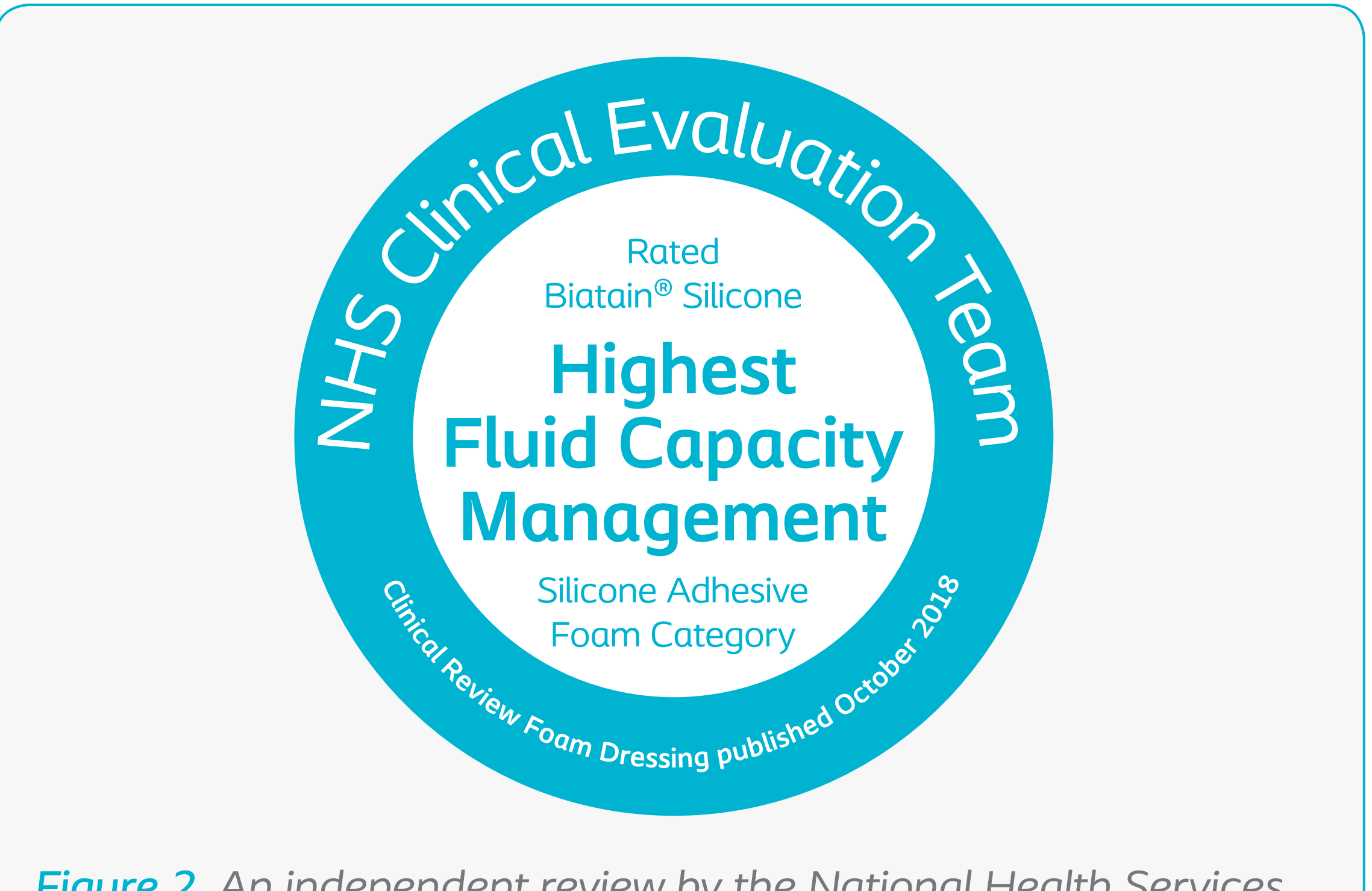
Figure 2. An independent review by the National Health Services (NHS) reached the same conclusion that Biatain Silicone has the highest fluid handling capacity among all silicone adhesive foams.

Higher total fluid handling capacity may also enable longer wear time and cost savings. For example, the average venous leg ulcer produces 0.43 \text{ g/cm}^2/24 \text{ hours of exudate}^7 \text{ Based on the results of the CET review,} the estimated average wear time is 5.89 days for Biatain Silicone vs. 2.21 - 4.21 days for non-Biatain dressings. Including costs of dressings and nurse time for dressing changes, using Biatain Silicone vs. other silicone foams may lead to potential cost savings of £1,113 - £4,661 per patient per year.<sup>8</sup>