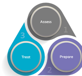
The Coloplast 3 Step Approach