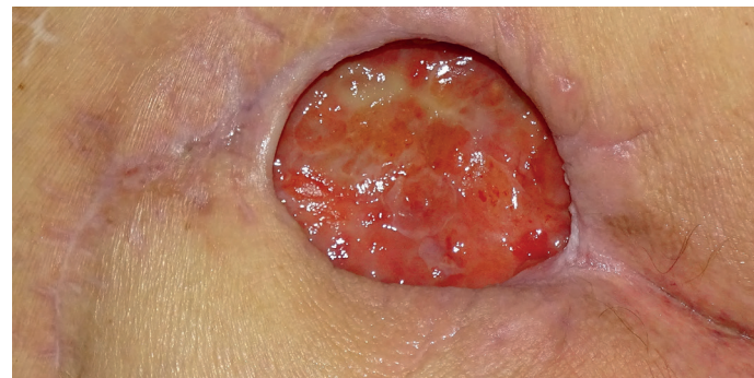
Fig. 3.1, 4.1: Dressing change after two days. The wound filler is removed in one piece. Biatain® Fiber has formed a cohesive gel and can easily be removed. Only a small amount of sloughy tissue present and needs to be removed from the wound bed. No maceration is present.