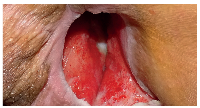
Fig. 6: A sacral pressure ulcer, wound depth 48 mm and with undermining areas 55/75 mm. Wound duration 8 months.