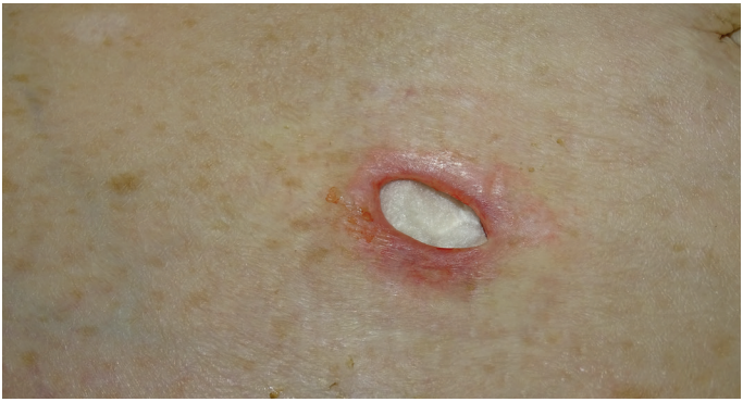
Fig. 3.2: Biatain® Fiber is applied with close contact to the wound bed. An absorbent dressing is selected as the secondary dressing.