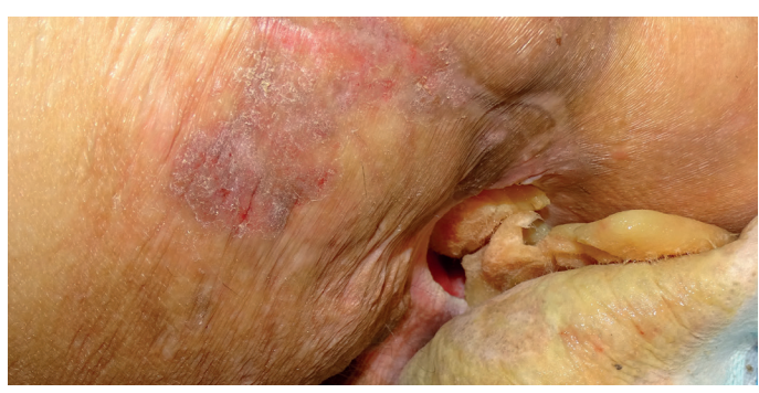
Fig. 10: Three Biatain® Fiber dressings have gelled and are being removed from the pressure ulcer (from Fig. 6).

They show stable gelling, easy swelling and atraumatic removal.