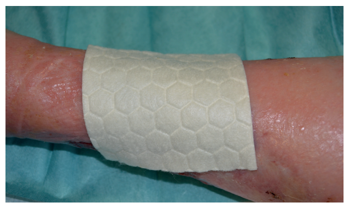
Fig. 3.3: Biatain® Fiber is applied and covered with a superabsorbent dressing (e.g. Curea® P1).

It was noted positively that the absorption and retention of the wound exudate of Biatain® Fiber was very good. No exudate was present on the wound edge and there were no signs of maceration.