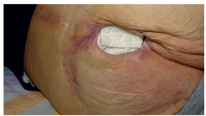
Fig. 7.1: The wound cavity is covered with a second dressing.