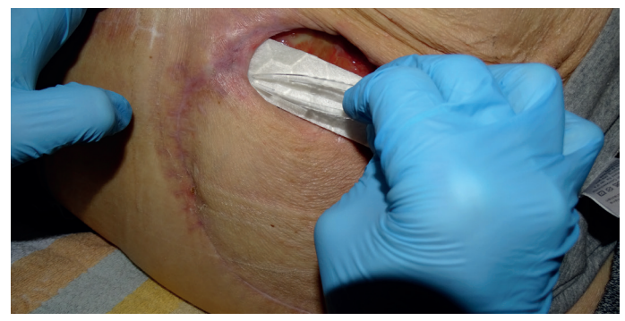
Fig. 5.1, 6.1: Instead of two dressings, a rope which is easier to apply, is applied into the undermining areas of the wound