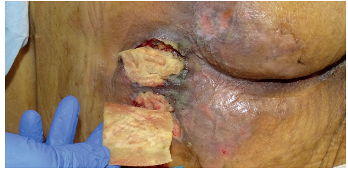
Fig. 11: Removal of Biatain® Fiber after 48 hours (from Fig. 7)