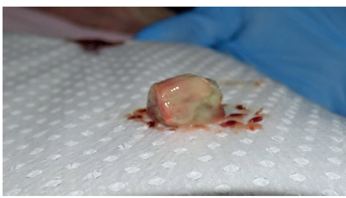
Fig. 6.2: Gelled Biatain® Fiber.