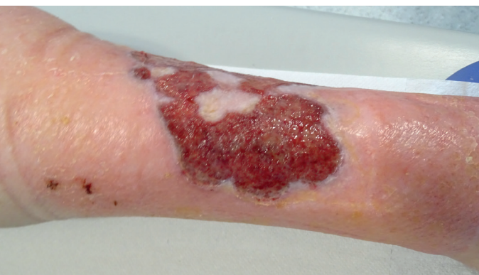
Fig. 8.3, 9.3: The redness in the wound area has disppeared.