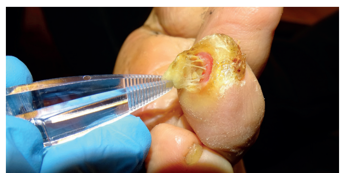
Fig. 13: Removal of the fitted piece of Biatain® Fiber after 72 hours (from Fig. 9)